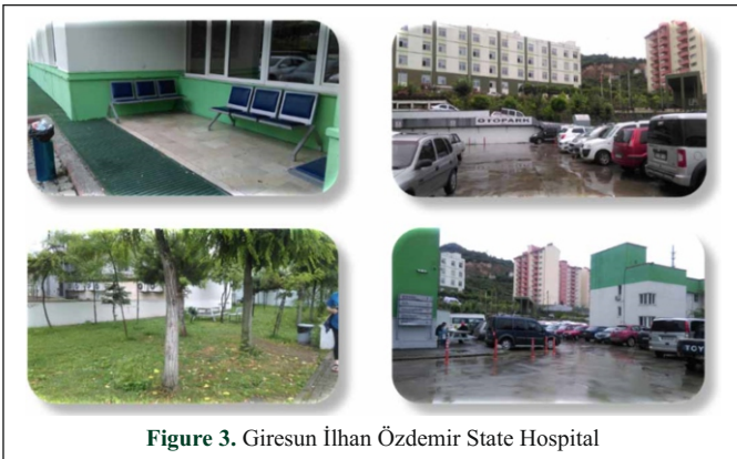
Figure 3. Giresun İlhan Özdemir State Hospital

It is located in the Teyyaredüzü Atatürk Boulevard and is easy to reach. State Hospital, Obstetrics and Gynecology Hospital, Community and Mental Health Center, Mouth and Dental Health centers are together. As in many hospitals, there is a shortage of parking area in the state hospital and the existing parking area is not sufficient. The surroundings of the state hospital is reserved for car park and emergency situations. There is limited space for patients, their relatives and hospital staffs to spend time outside of the hospital. There are no seating areas or green areas except for a few banks and canteen around the hospital. The lack of small recreation facilities around the area appealing to a large audience is an important deficiency. Despite the new construction, the area is not used regularly and does not obviate the needs of the users.