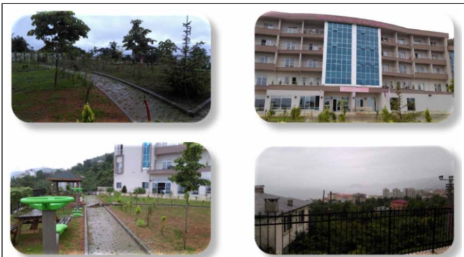
Figure 4. Giresun Elderly Care and Rehabilitation Center

It is located in Erikliman-Giresun and is access from the Giresun Island view. The institution was put into service in 2015 and is serving the patients over 60 years of age. There are 77 patients and 65 staff. The green area /construction rate was complied with while the institution was being built. The institution is located in the green area and has a garden with promenades, benches, camellias and sports equipment. There is a sports coach in the institution and sports with elderly and patients, are performed regularly. There are promenade areas where the elderly and the patients can walk around the area to make themselves more self-confident. Within the area, roads are designed to allow vehicles for emergencies and parking and gazebos are located at the back of the building.