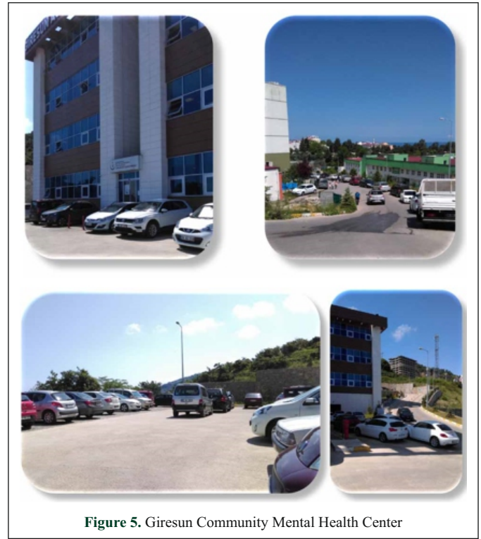
Figure 5. Giresun Community Mental Health Center

It is located in next to İlhan Özdemir State Hospital as the administrative department. Parking area and garden are common areas for that two facilities. The building is shared with Mouth and Dental health center. The building is surrounded by parking area and the seating areas are insufficient. There are no places where patients can spend free time.