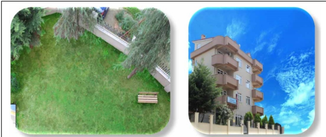
Figure 2. Atasev Special Education and Rehabilitation Center

The institution has been serving for 10 years. It is interested in children in need of special education. The center is a house with a garden and is a place where children can have fun in the grass and among the a few trees. The garden walls are concrete and the place is covered with trees. One-to-one education is given to children, and picnics, painting, seeing historical places, planting etc. activities are done and the development of children was supported. There is no parking area for cars. Outside the grass area and several seating units, the garden does not have a special function.